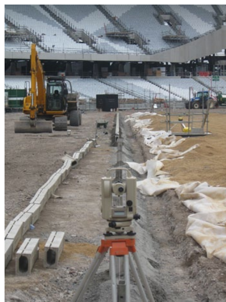
ACO drainage during installation.

ACO's ability to innovate and customise products to meet specific requirements was a benefit for the Westfield Shopping Centre development adjacent to the Olympic Park. In excess of 800m of drainage channel was provided covering the main shopping concourse, walkways, steps and bridges. Specially designed polymer concrete channels were fitted with discrete Brickslot gratings to meet the specific aesthetic requirements of the project with required hydraulic efficiency. The project gave another example of ACO expertise in providing bespoke solutions, working closely with its customers to ensure requirements for every aspect of an installation are met.